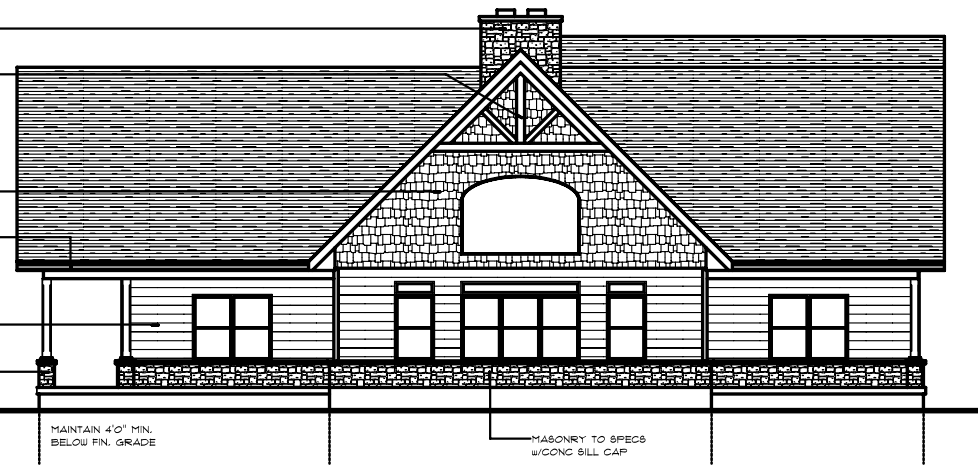
WEST ELEVATION SCALE: 3/16" = 1'-0"